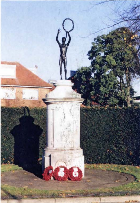
WORLD WAR I MEMORIAL