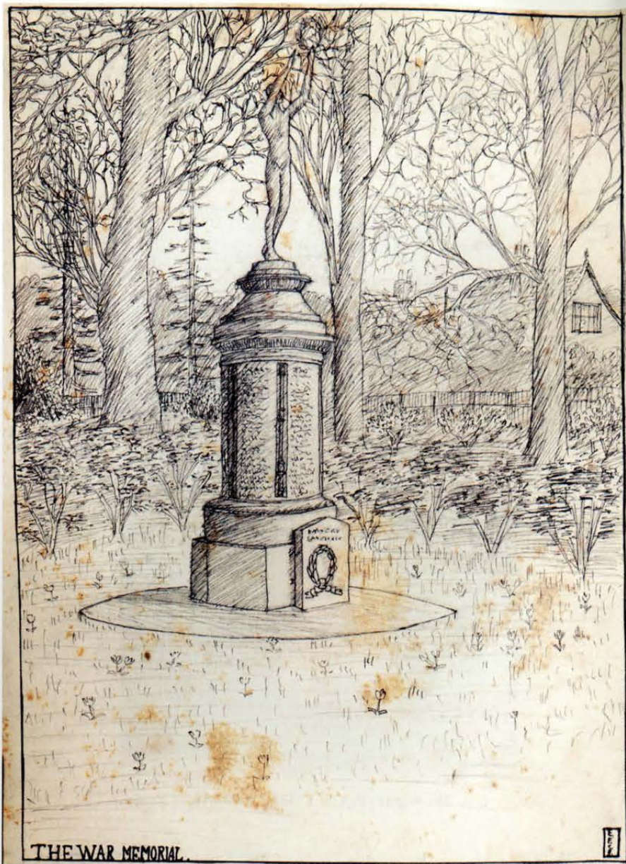
THE WAR MEMORIAL.