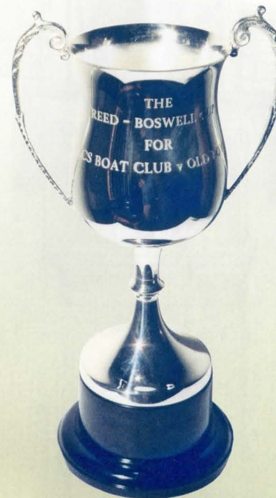
The new Reed-Boswell Cup, to be presented annually to the winning team in the OK v School Boat Race (see page 12 of this Newsletter).

Registered in England No. 1882088 V.A.T. Number: 391 5689 10 Registered Office: King's College School, Wimbledon, London SW19 4TT